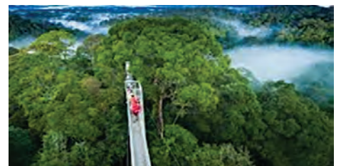
Ulu Temburong National Park

One of many waterfalls, this one is located just a short walk from the heart of the city, Tasek Lama Recreational Park is a popular spot with locals and visitors alike in Brunei's capital of Bandar Seri Begawan.