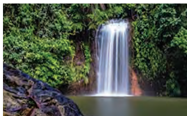
Tasek Lama Waterfall

Home to around 30,000 people, Kampong Ayer is known as the 'Venice of the East' and consists of 42 stilt villages built along the banks of the Sungai Brunei (Brunei River). A century ago, half of Brunei's population lived here, and even today many Bruneians still prefer the lifestyle of the water village to residency on dry land. The village has its own schools, mosques, police stations and fire brigade.