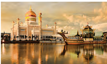
Sultan Omar Ali Saifuddin Mosque

The mosque serves as a symbol of the Islamic faith in Brunei and dominates the skyline of Bandar Seri Begawan. The building was completed in 1958 and is an example of modern Islamic architecture