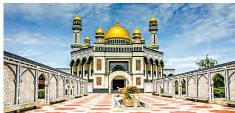
Jame' 'Asr Hassanil Bolkiah

The mosque serves as a symbol of the Islamic faith in Brunei and dominates the skyline of Bandar Seri Begawan. The building was completed in 1958 and is an example of modern Islamic architecture