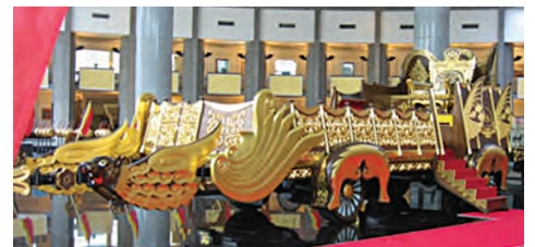
The Royal Regalia Museum

A waqf (gift) of Sultan Hassanal Bolkiah, the 29th and current Sultan of Brunei. The construction began in 1988 on a 20-acre site in Kiarong. The mosque was inaugurated on 14 July 1994 in conjunction with His Majesty's 48th birthday celebration.